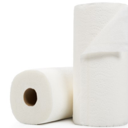
Paper Towels & Soiled Items